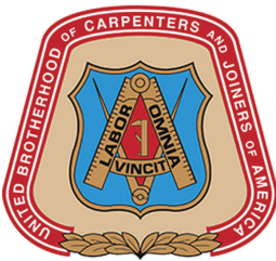
Carpenters Local 1260