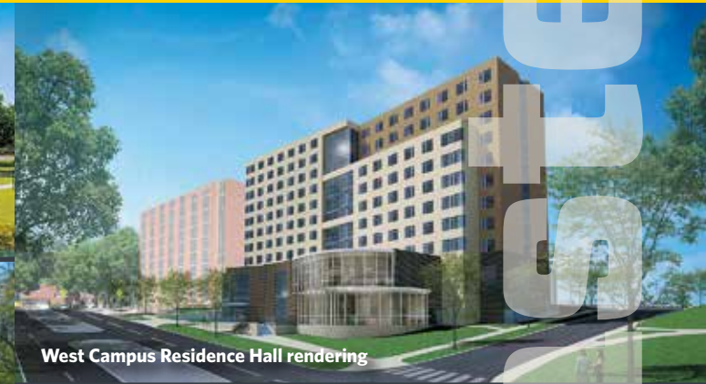
West Campus Residence Hall rendering