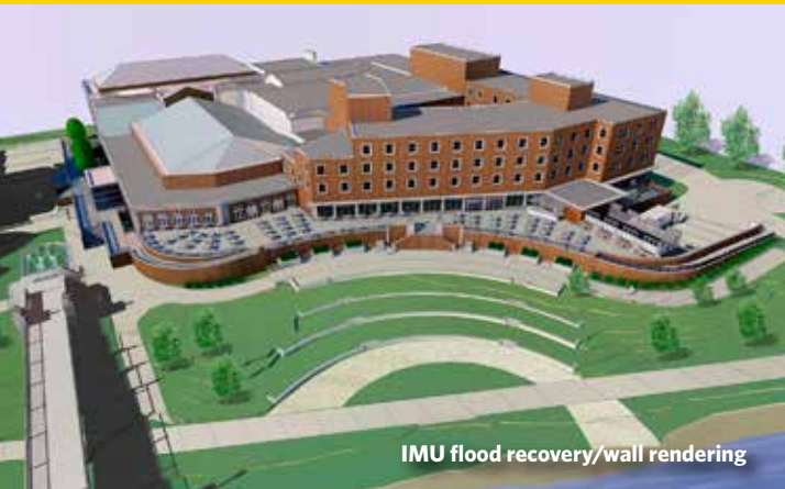
IMU flood recovery/wall rendering