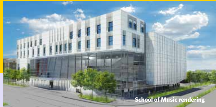
School of Music rendering