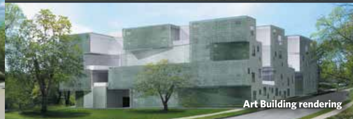
Art Building rendering