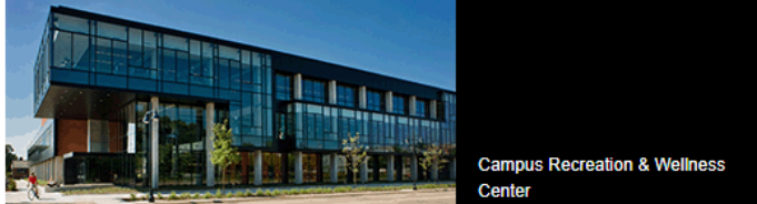
Campus Recreation & Wellness Center