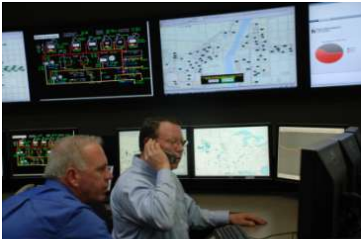
Real-time displays of energy usage for all buildings connected to the campus utilities system are monitored and evaluated by energy engineers.

While some of the benefits of the ECC will no doubt result in sizeable long-term paybacks, there are already a number of favorable outcomes with respect to energy savings, performance, maintenance, improved occupant comfort and enhanced communications.